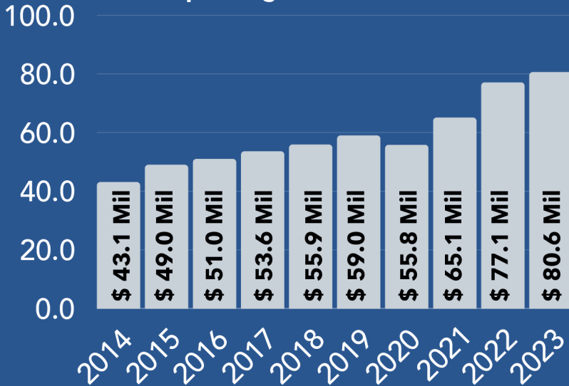
Visitor Spending in Wabash Co. in Millions

$.44 of every dollar spent by visitors remained local.